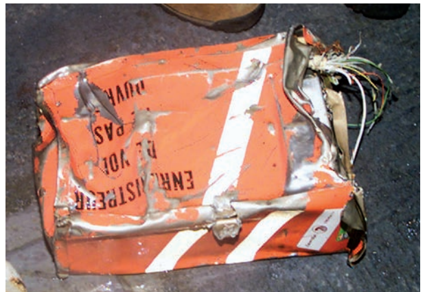
MEMENTO MORI: This black box alone was left to tell the story of the crash of EgyptAir Flight 990.

The information recorded, the sampling rate, and the order in which the data are stored differ. The manufacturers supply the software and hardware needed to read and analyze the data and sometimes send representatives to help interpret them. They may have their work cut out for them if the box is dented, twisted under high heat, or has damaged cable interfaces. In