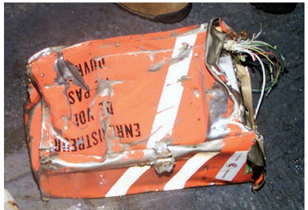
MEMENTO MORI: This black box alone was left to tell the story of the crash of EgyptAir Flight 990.

The information recorded, the sampling rate, and the order in which the data are stored differ. The manufacturers supply the software and hardware needed to read and analyze the data and sometimes send representatives to help interpret them. They may have their work cut out for them if the box is dented, twisted under high heat, or has damaged cable interfaces. In